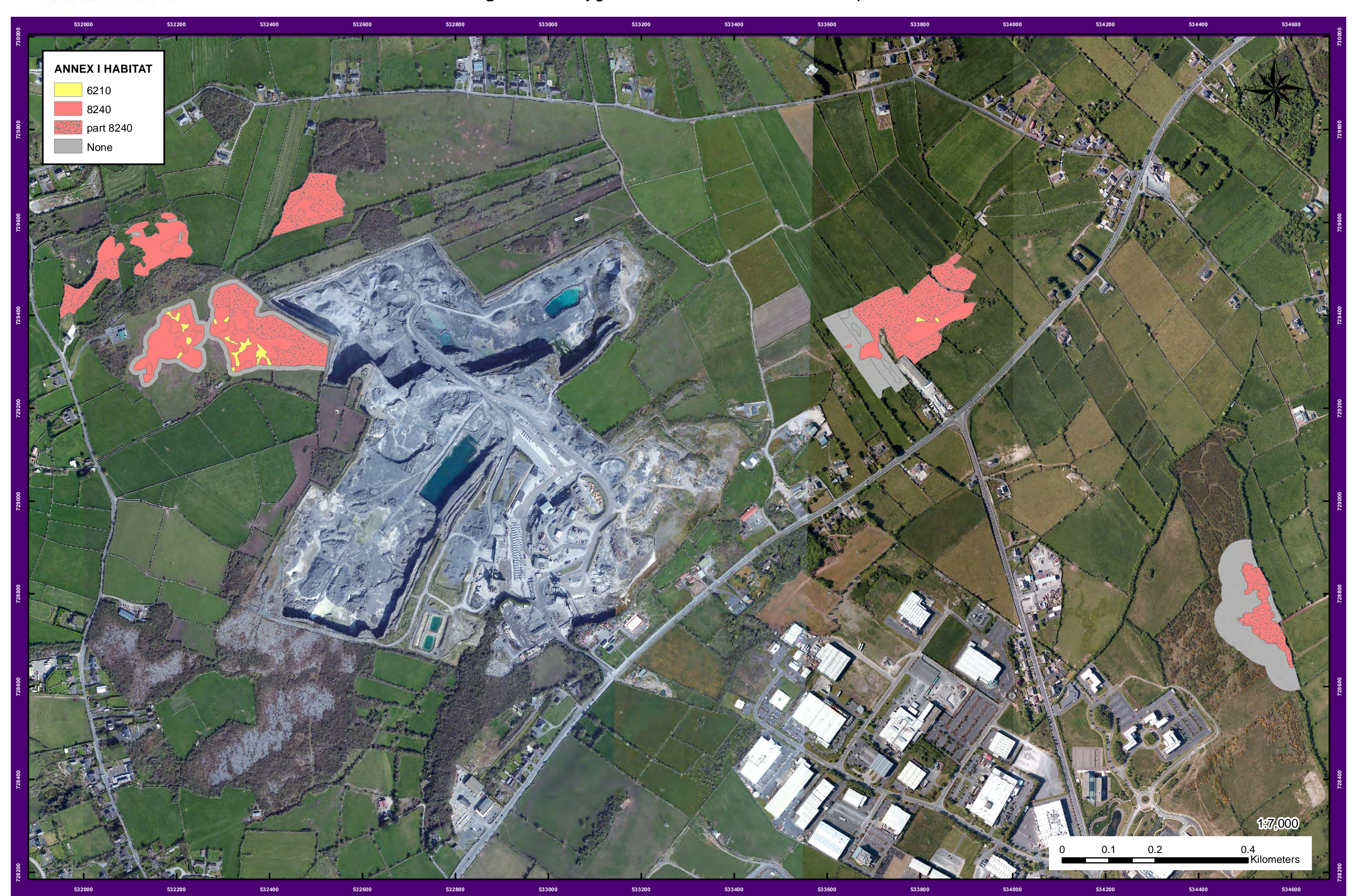
Figure 1. Ballygarraun area Annex I habitat map